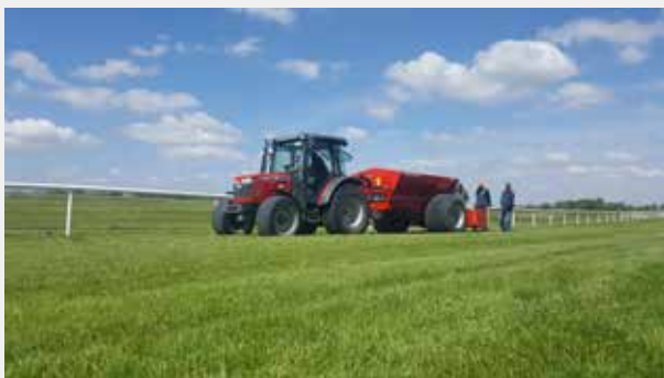
Combi-spread during divot repair on race track