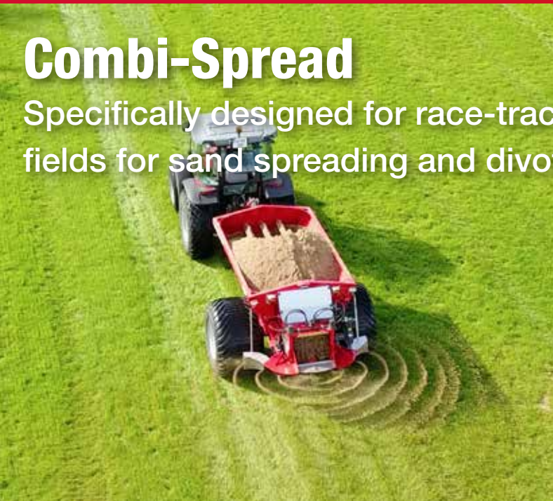
Sand spreading on race-track

Specifically designed for race-tracks, stud farms and sports fields for sand spreading and divot repair