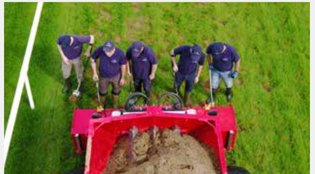
Over-view of repair work underway on track