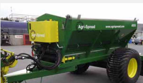
Pto Pump. Optional equipment for tractors with low oil flow capacities.