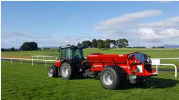
AS35 Combi-spread on Ballinrobe Race-course, Co. Mayo, Ireland