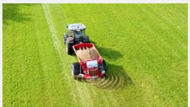
Sand spreading on race-track