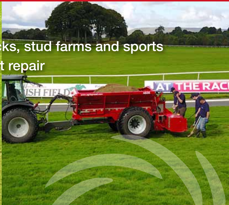
Divot repair attachment fitted and repair work underway