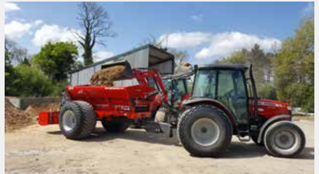
AS35 Combi-Spread been loaded with sand, Peat and soil mix for divot repair